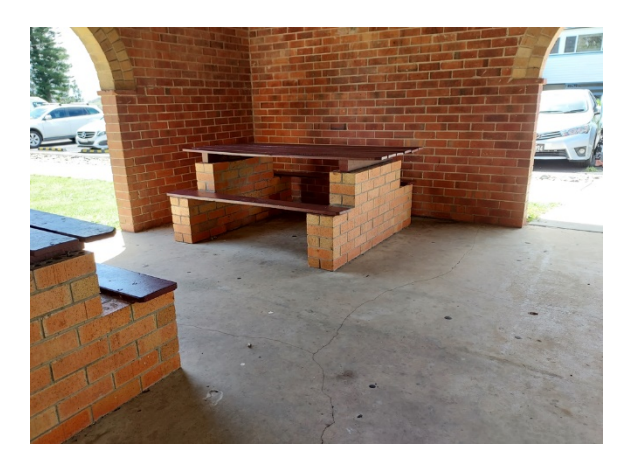
There is also a public barbecue available

There are numerous picnic tables spread across the space, some shaded by trees.