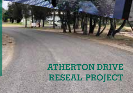
ATHERTON DRIVE RESEAL PROJECT

$1.9M INVESTED IN PROMISED LAND & GLENIFFER ROADS