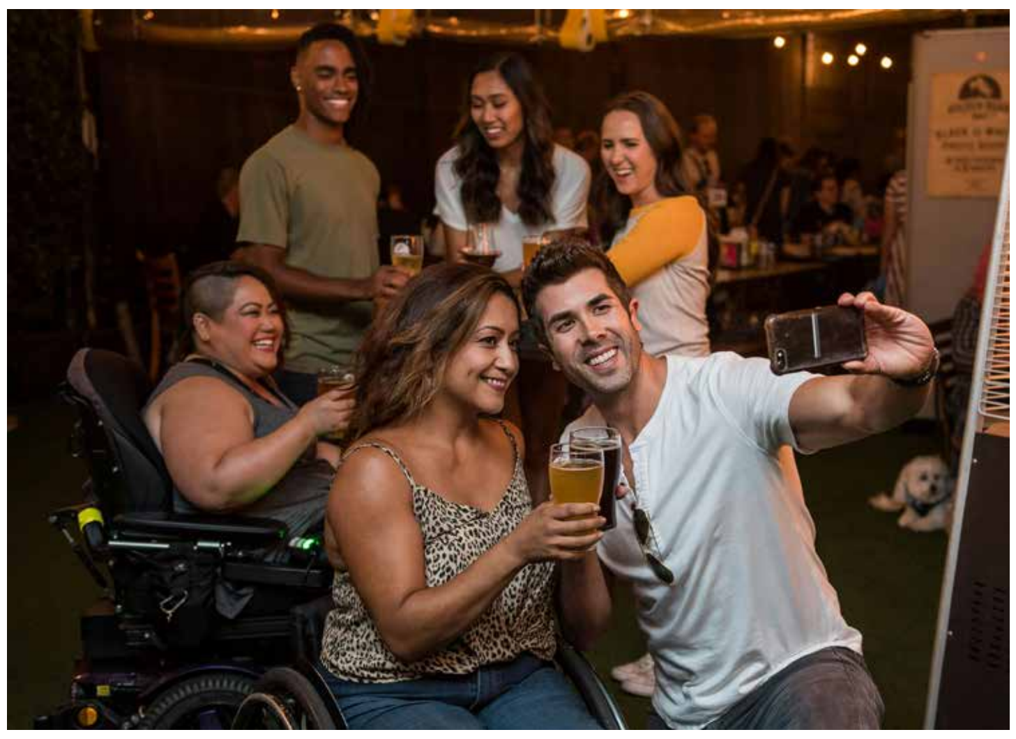
Please note the information in this guide is current as of June 2024 and is subject to change.

If you would like any further information regarding accessible options, please call the Waterfall Way Visitor Centre on (02) 6655 1522 or drop into the centre 29-31 Hyde Street, Bellingen.