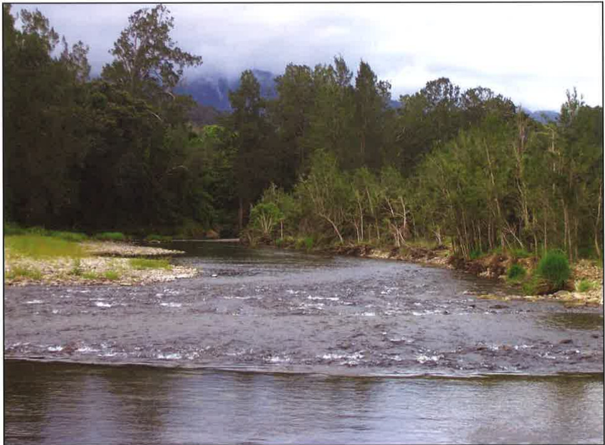
River oaks at Gordonville Crossing on the Bellingier River

River oaks have always been part of the riverine landscape of the mid-north coast of New South Wales. Early settlers' notes suggest that vegetation grew in the river as well as on the floodplain when these valleys were first surveyed. These river oaks would have grown as emergent species within the floodplain forest and as colonisers on gravel bars. Today, river oaks are more common and numerous, and this increase is largely due to an increase in suitable habitat. This has led to the need for their management in some situations.