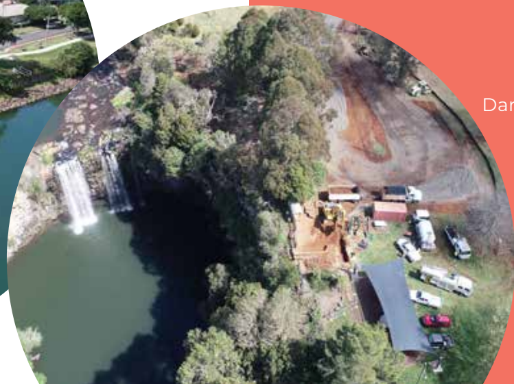
Dangar Falls viewing platform upgrade