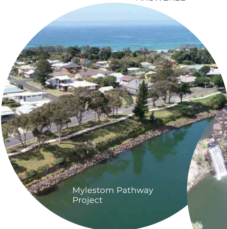
Mylestom Pathway Project

WATER, SEWER, ENVIRONMENT AND WASTE *INC FLOOD EVENT