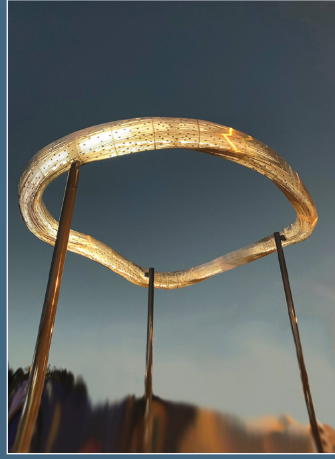
"Water Cloud" by Stuart Green, Dorrigo