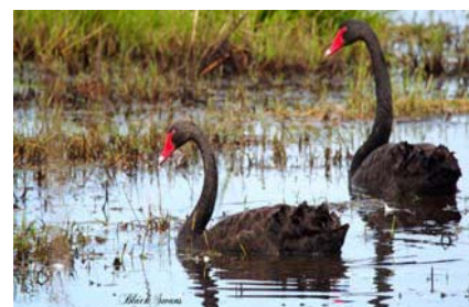
Black Swans