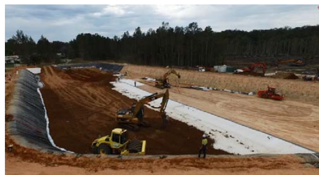
The base of the containment cell during construction (2016)

A water quality contractor used a pioneering method of treating and discharging large amounts of contaminated water so that it was clean enough to be discharged into the wetland before the excavation of the underlying sediments.