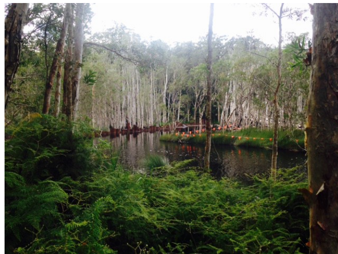
A view of Urunga Wetland

As the water in the wetland will be monitored over the next two years to assess improvements since remediation, visitors are advised to refrain from swimming and boating in the wetland.