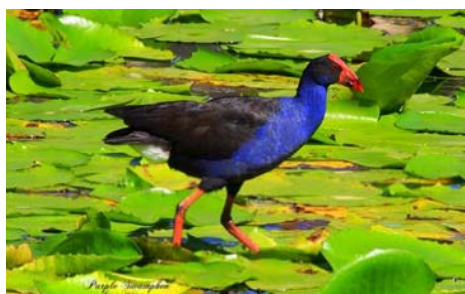
A Purple Swamp Hen

The wetland is increasingly becoming a destination for bird watchers. Some of the birds you can expect to see are shown below.