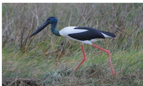
A Black-necked Stork