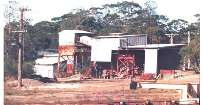
The old antimony processing plant (circa 1980)

No clean-up or remediation was done, and the site was eventually sold to a private owner.