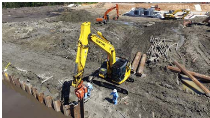
Installing a sheet pile wall to hold back the wetland water

It took 16 months to complete this technically complex project.