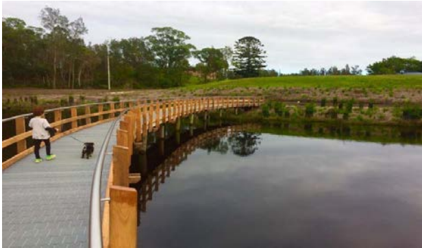
Timber boardwalk over Urunga Wetlands

The Urunga Wetlands site is now a valuable community space following a $10 million program of extensive remediation and parkland work. It has been transformed from a once barren wasteland to a lively wetland habitat.