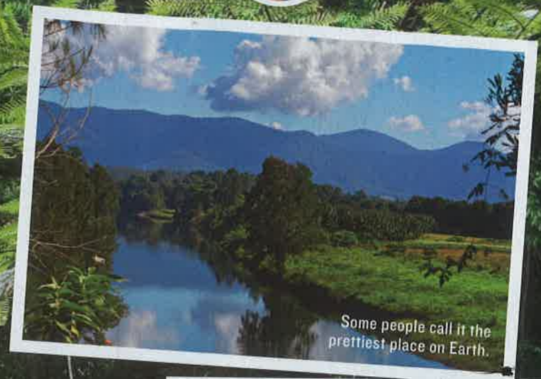
Some people call it the prettiest place on Earth.

Join Fast Ed on a recipe road trip to Bellingen on BHG TV , April 20.